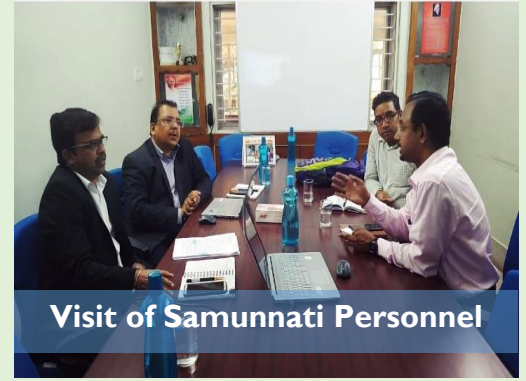
Visit of Samunnati Personnel