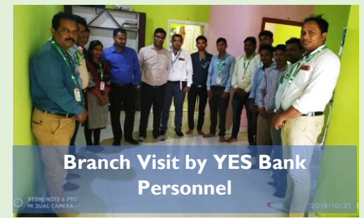
Branch Visit by YES Bank Personnel